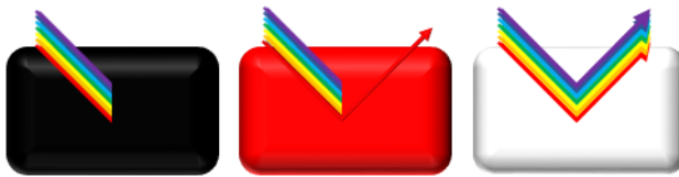
Figure 1. How objects with different color reflect incident white light

Newton also provided the first systematic explanation that the color of objects depends on their interaction with incident white light (Figure 1). Each object absorbs certain rays and reflects others, the latter constituting the perceived color (Newton 1704, 135). This account shifted the understanding of color from being a property of object surfaces to being a property of light itself.